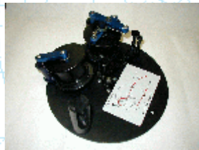
Payout head (top view)